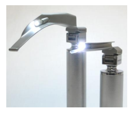
LED technology ensures whiter, brighter illumination with fewer shadows. The light emitting diode generates an increased number of photons which bounce off the inner surface in a mirrored effect. The result is increased light output with optimal, focused task illumination.